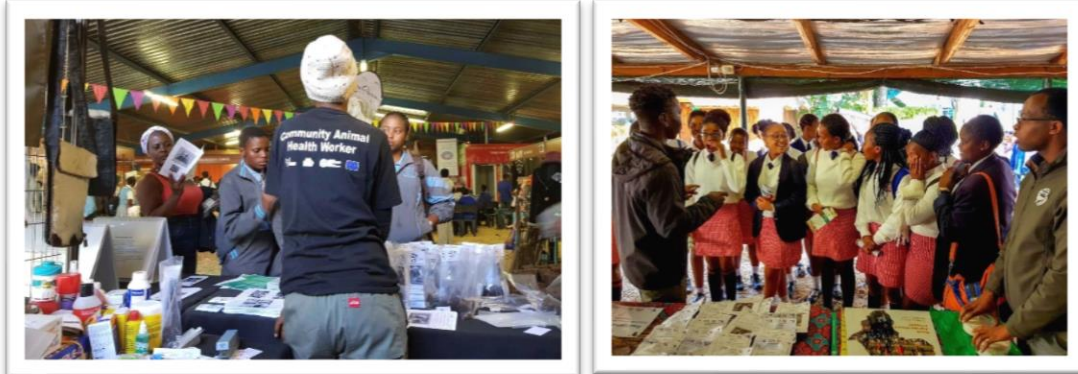
CAHWs and staff interact with public and explain the project

HPSA's Jozini Agricultural Model Project covers four areas in the Umkhanyakhude District and the Zululand District - Jozini, Nongoma, Hlabisa and UMhlabuyalingana. The project, funded by the European Union, started in May 2015. The project aims to help 2400 farmers increase their livestock production. Part of the project activities are focused on helping goat farmers increase their productivity and assist with formalising the indigenous goat market by linking stakeholders throughout the value chain and organising goat sales at pension points and regular auctions. Project partners are Department of Rural Development and Land Reform, Mdukatshani Rural Development Project and the KZN Department of Agriculture and Rural Development.