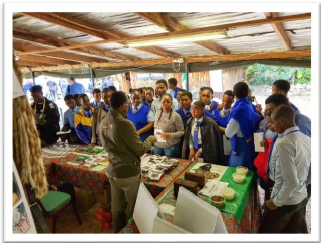
School children learn about the possibilities of commercialising goats

Over the past two years, there have been 125,00 and 130,000 people attending the Royal Show and passing through the exhibitions. This has unprecedented exposure to HPSA, the Jozini Project and its funders, like the European Union. The display space was provided free of charge by the Durban Municipality. Community Animal Health Workers peopled the stand all ten days of the show giving them an opportunity to share their knowledge and experience.