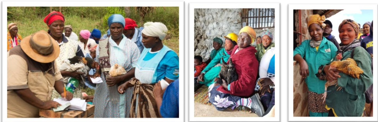
Farmers wait with colourful chickens as their details are being captured

The training and POG is also attended by the local headmen and chairman of the Livestock Association. This helps support compliance where farmers chose beneficiaries where farmers are deserving of receiving the gift.