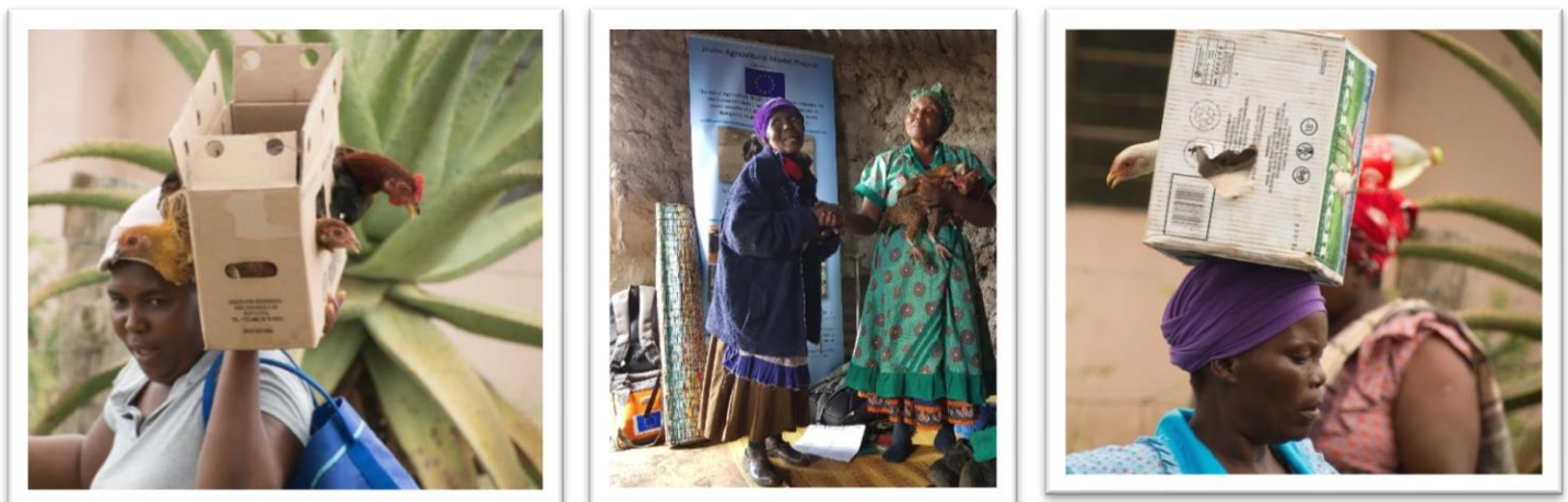
Farmers carry their chickens home in ingeniously adapted containers; Farmer receives chickens from another farmer (middle)

The ladies proudly pose with the new owners of the chickens and remind them to look after the chickens that come from a good home.