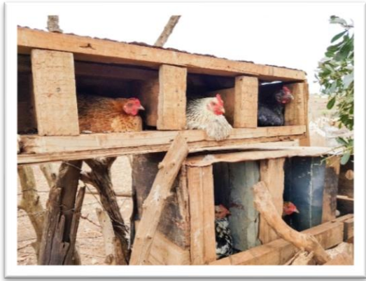
Farmer applying knowledge learned from training on her newly acquired chickens by checking their feet for scaly mites (left); Chickens in a homebuilt nest (right)

For more information, please visit www.hpsa.org.za or www.gapkzn.co.za .