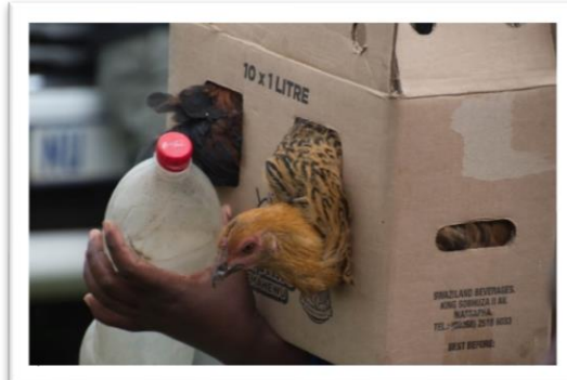
The headman speaks to the group about responsibility towards the project (left) and empty bottle to be returned home full of vaccine (right)